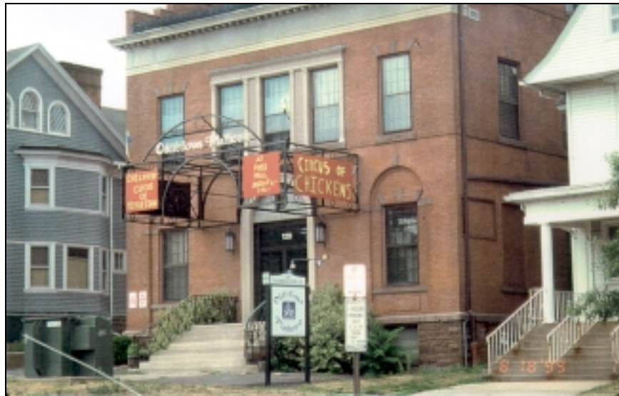
Oddfellows Playhouse Youth Theater

The Buttonwood Tree is located at 605 Main Street in the North End neighborhood. Established nine years ago, the non-profit arts organization offers musical performances, literary and poetry readings, theater, storytelling and other visual arts events.