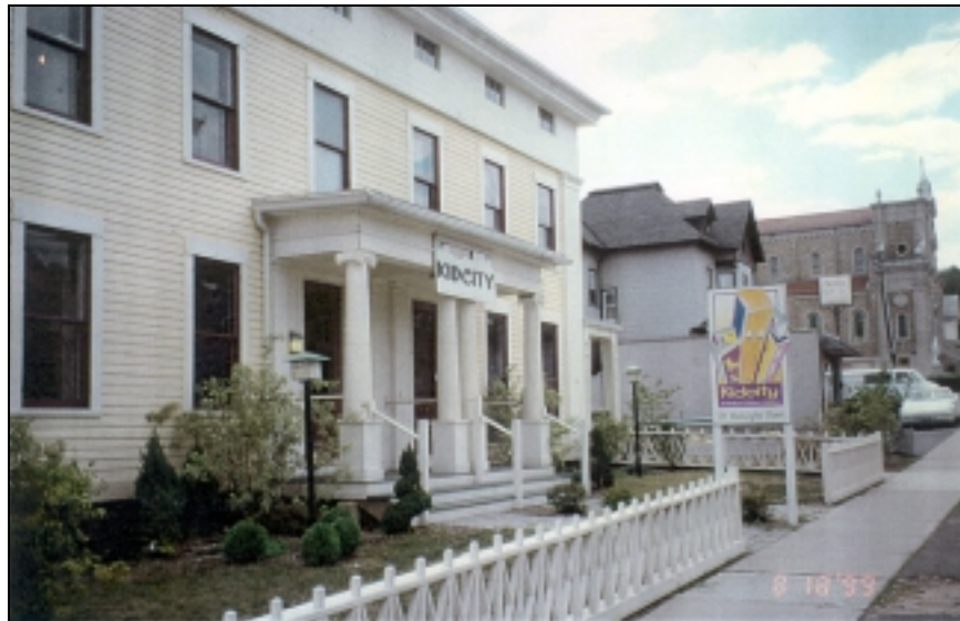
Kidcity Children's Museum

The Submarine Library Museum, located at 440 Washington Street, houses a collection of World War I and World War II submarine memorabilia. The Middletown Sports Hall of Fame & Museum is located at 58 Bernie O'Rourke Drive, next to the Bernie O'Rourke athletic field.