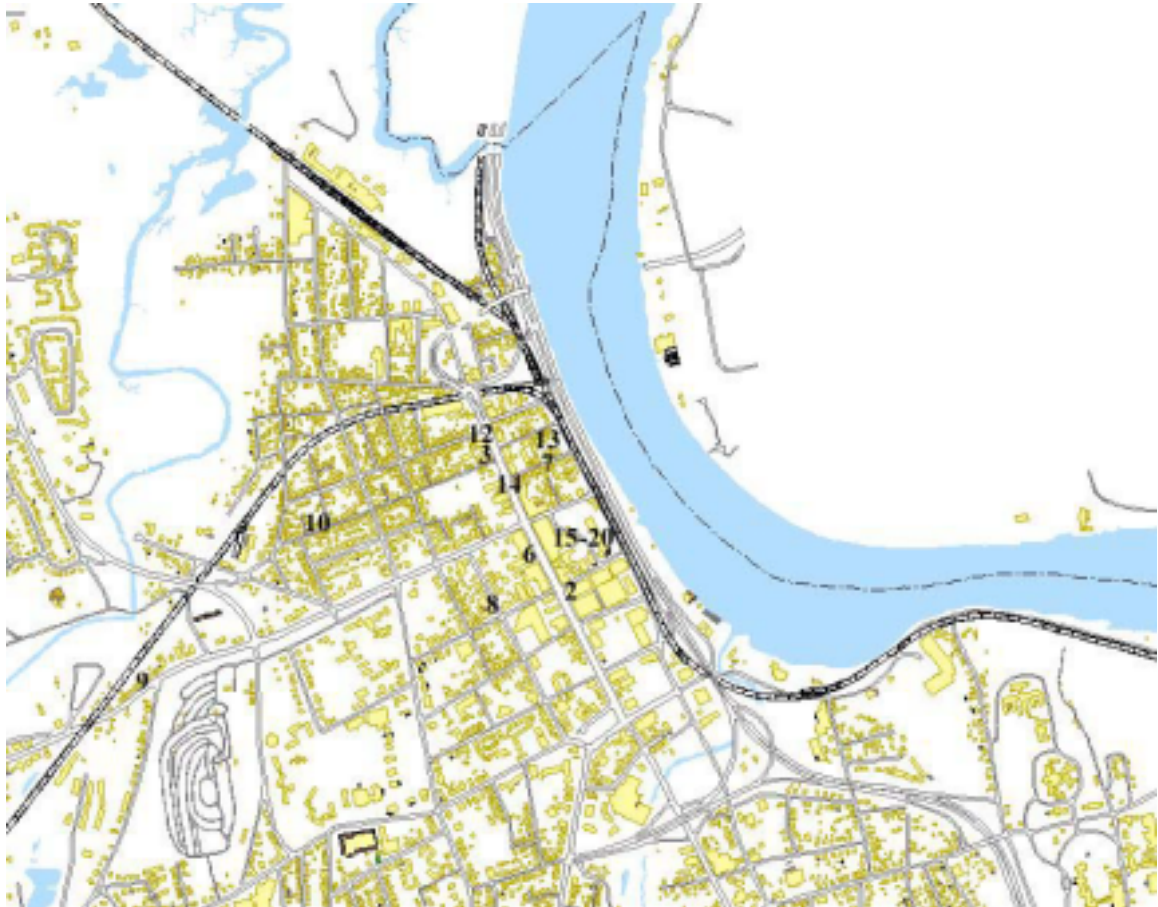
Map 1- Downtown Map