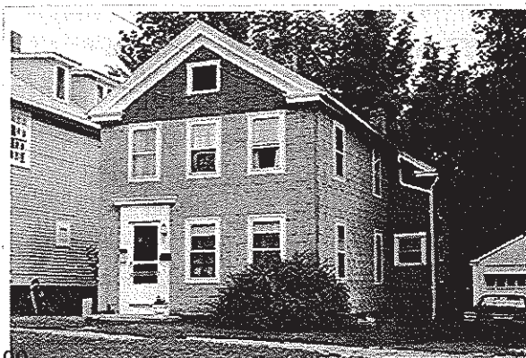
19 Warwick Street