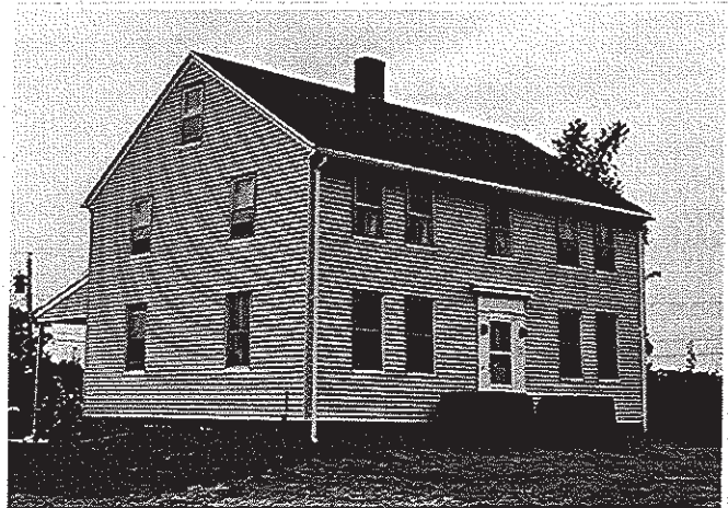
325-27 Saybrook Road

date: 8/78 view: northeast negative on file: Roll 36, #22-22A