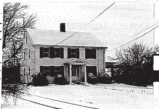
113 Saybrook Road

19. SOURCES: Middletown Tax Assessors; 1874 Beers Atlas